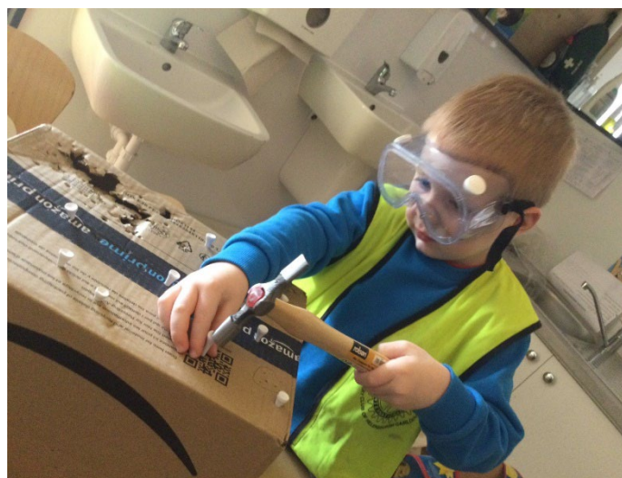
Colgrain Primary and Pre-5 Unit